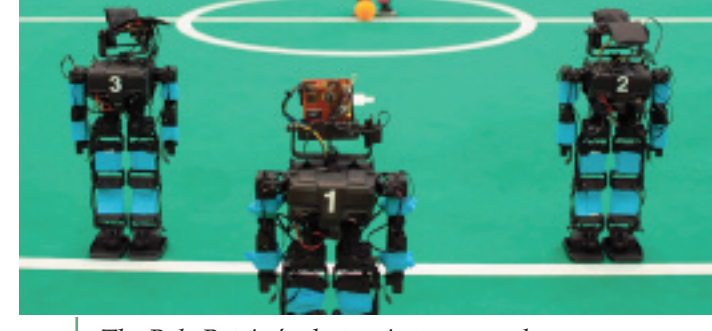
The RoboPatriot's electronic team members.